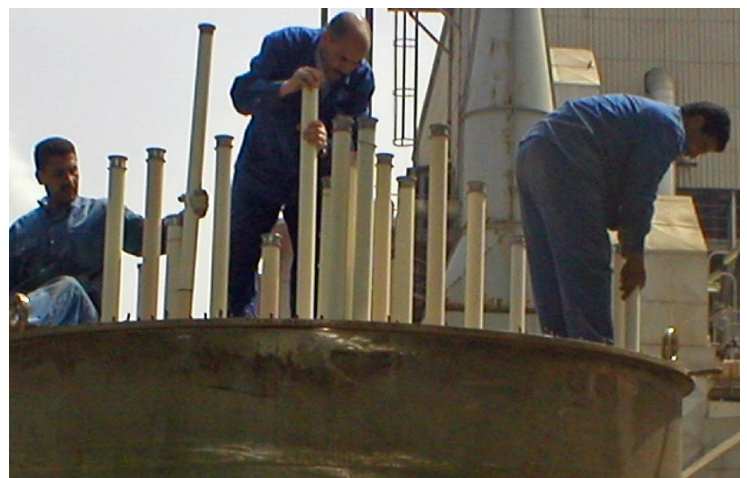
Installation of Mantec's ceramic filters in the Mixed Gas Vessel

The gas mixture is around 10% ammonia / 90% air and typical flow rates through such a vessel would be 240 m 3 /hr at 230°C.